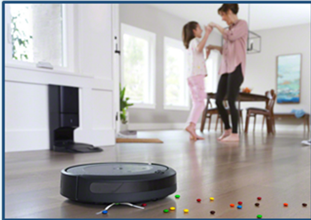
IMAGE 1 An AI robotic vacuum cleaner

son buys his father a home robot that can talk, cook and clean. It reminds Frank to take his medicine. Although initially unhappy with the arrangement, Frank slowly starts to see the robot both as a functional tool and a companion. By the end of the film, a close bond has developed between a man and a machine. With the number of older people in our society increasing, it is possible that in