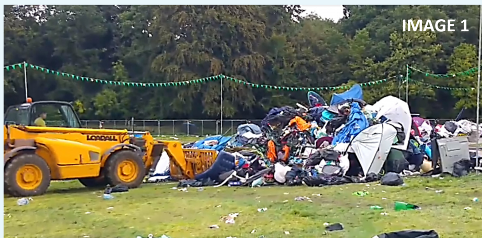
Some of the clean-up operation after Electric Picnic, 2018.

This text is based on several blog posts from the website of the organisation, Friends of the Earth. The blogs encourage people to act as volunteers with Friends of the Earth at Electric Picnic.