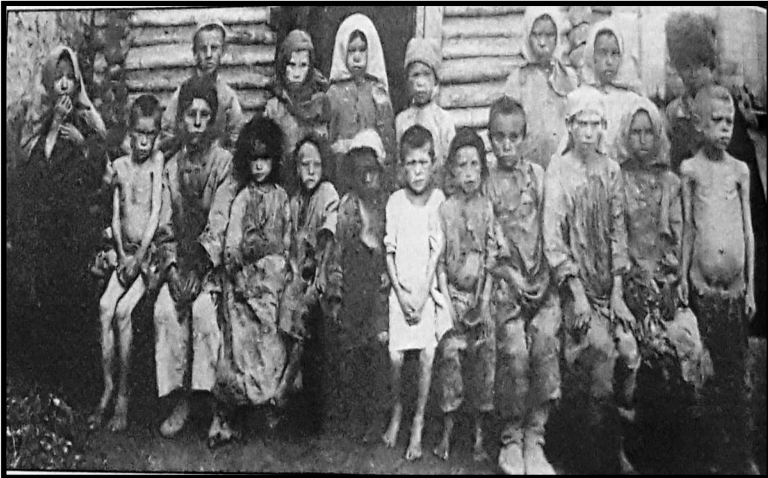
History by C Culpin]

The photograph below shows starving Russian children as a result of War Communism.