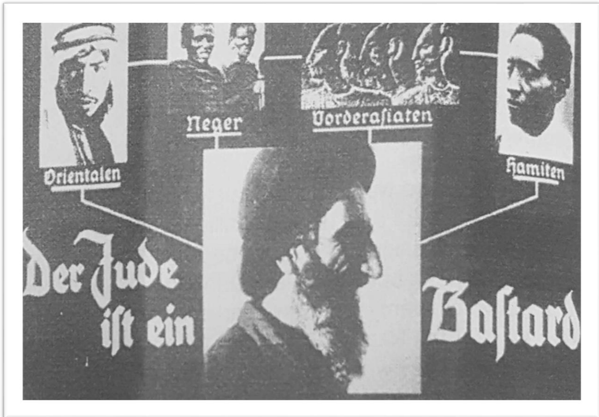
[From The Nazi Era: Racial Policies ]

This frame from a Nazi film strip, that was made to be shown in schools, shows that their racial hatred was not just directed at the Jews. The caption reads “The Jew is a bastard”. The image was meant to link Jews to other groups deemed inferior – eastern peoples, blacks, Mongols and east Africans.